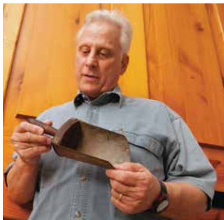
“I found this in an antique shop, and because I turned several thousand of them, I wondered if I had made it.”