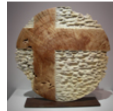
Jack Slentz Sand Disk , 2006 Wood 14 x 3 x 14.25" $2,800 + s/h