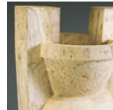
Marcus Tatton Pit Sawn Amphora , 2004 Maple, enamel pigments 54 x 30 x 28" $7,500 + s/h