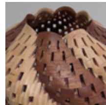
Bill Smith Emergence , c.2006 Wood 6 x 7" diam $1,800

"My work often provides for many hours of contemplation during the glue-up stage. This quiet and mentally uncluttered time allows my mind to wander and create associations between the developing piece and my mind's eye view of mythical places and imaginary things."